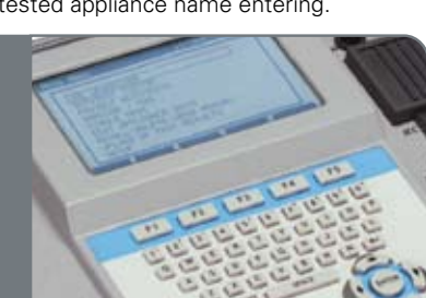
Large LCD with backlight and QWERTY keyboard.