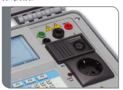
Connector panel - test ports for fixed installed appliances.