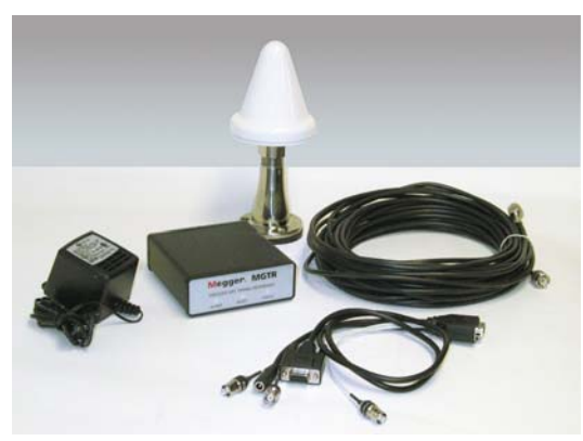
MGTR Unit with Accessories