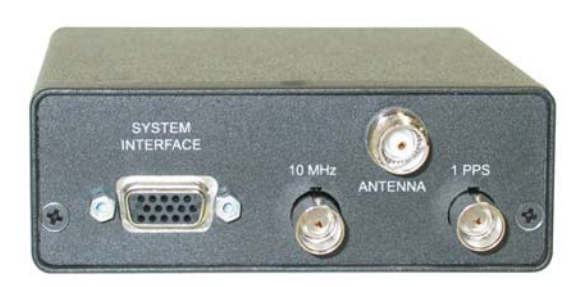
MGTR unit Rear View