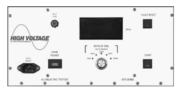
DTS-60D Front Panel